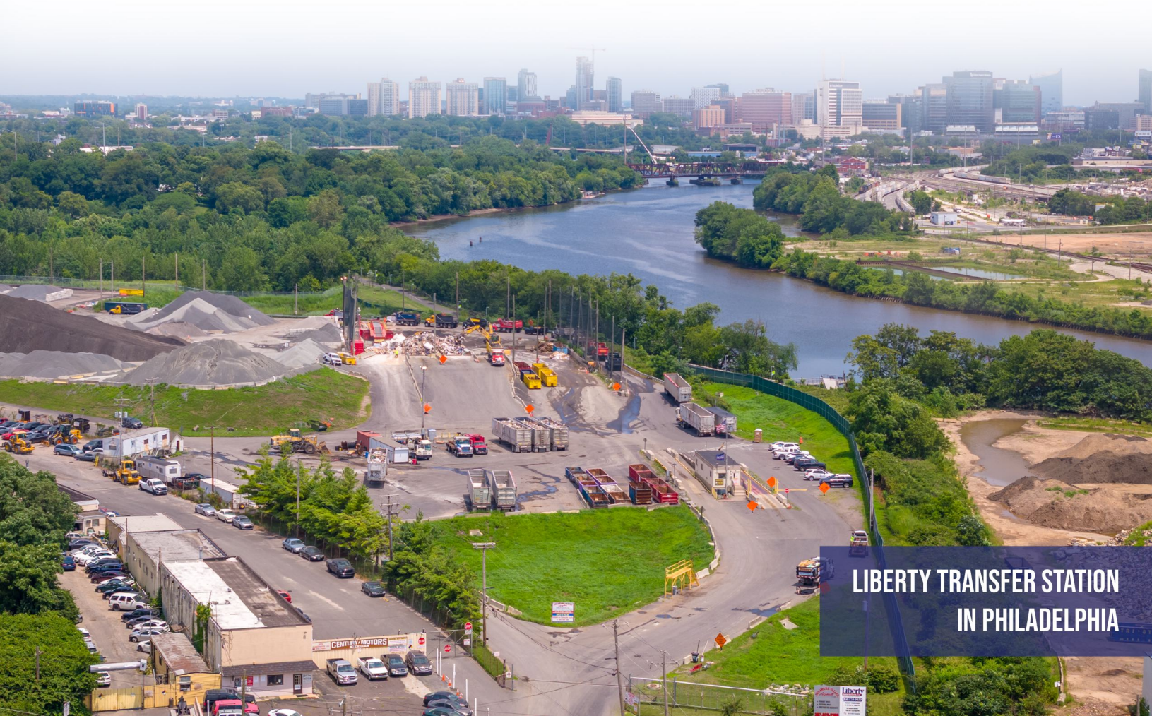
LIBERTY TRANSFER STATION IN PHILADELPHIA

Our comprehensive reporting simplifies the often-complex data collection process, allowing you to demonstrate your commitment to responsible waste management and earn valuable points towards your LEED certification.